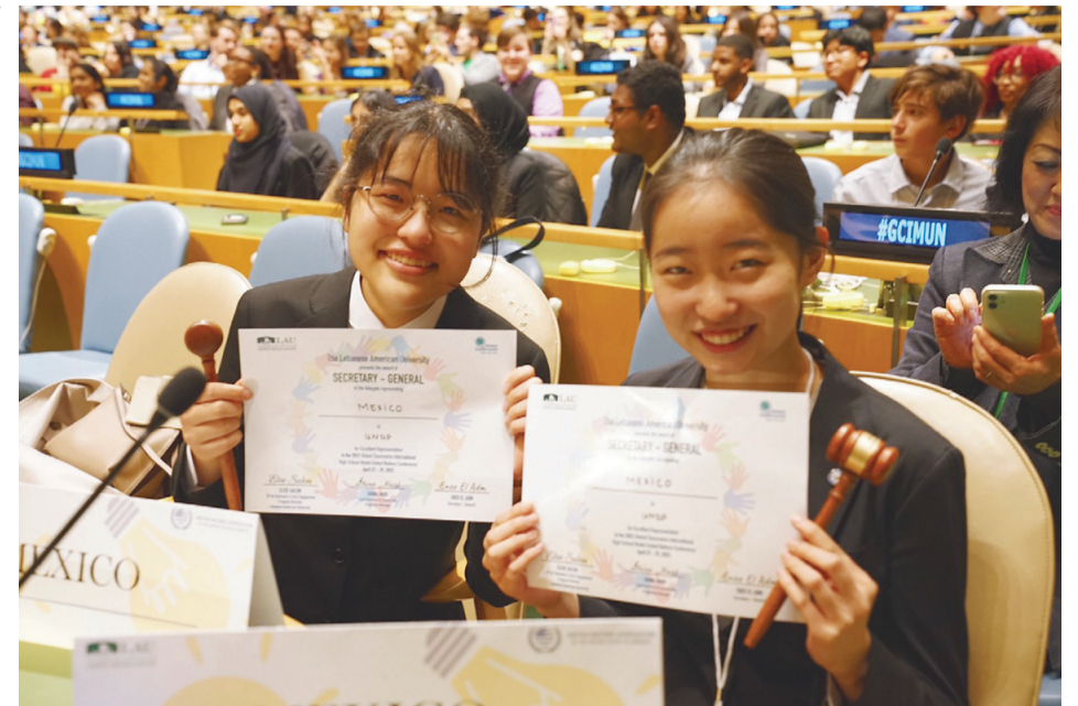
Shibuya Senior High School students receive U.N. Secretary-General's Awards at the Global Classrooms International High School Model United Nations Conference at U.N. headquarters in New York in April. SHIBUYA JUNIOR AND SENIOR HIGH SCHOOL

In addition, students' developmental process of three years of junior high school and three years of high school are more